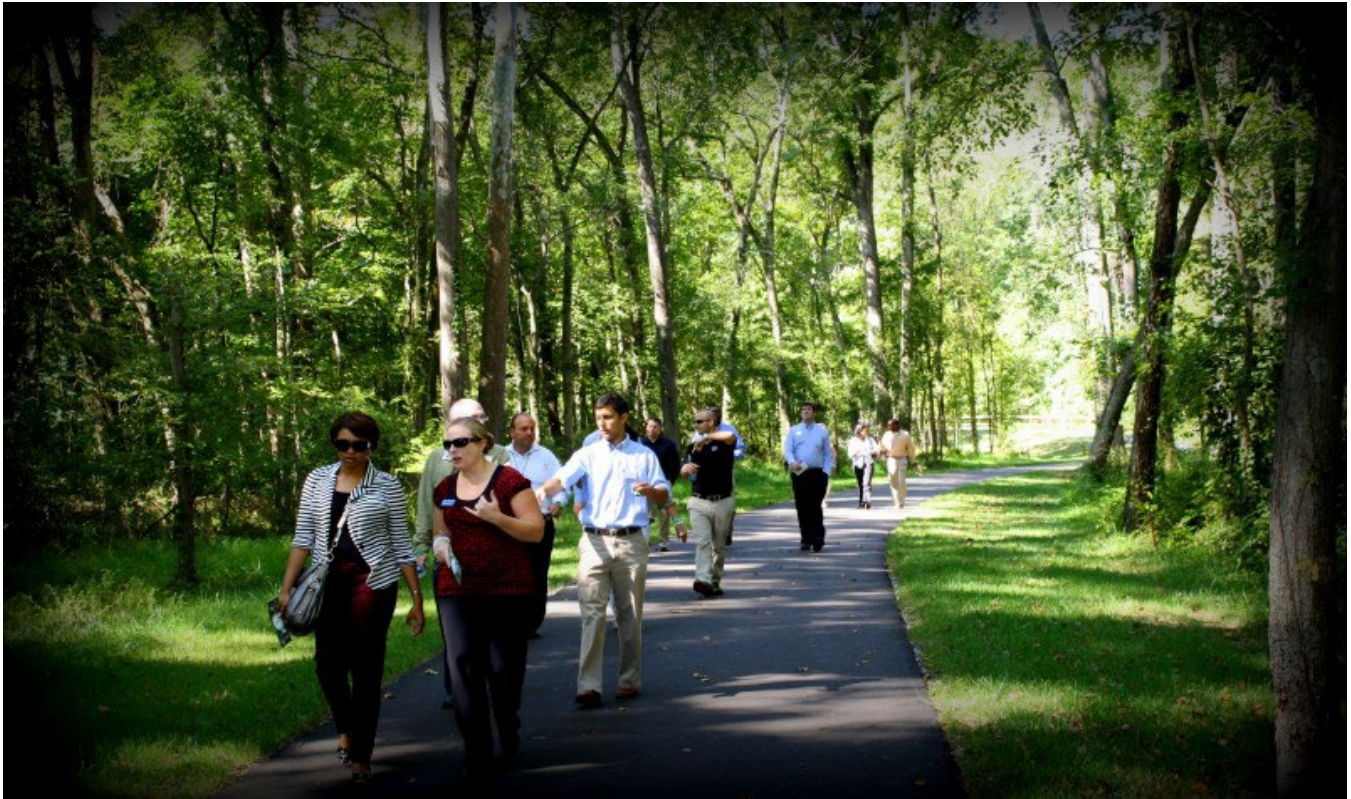
Leadership Rowan members walking the Salisbury Greenway.